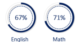
Remedial Course Pass Rates 2016-2018